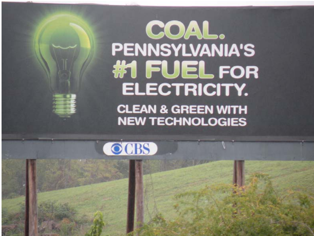
Billboard sponsored by Families Organized to Represent the Coal Economy (FORCE) http://ecoscraps.com/2008/09/